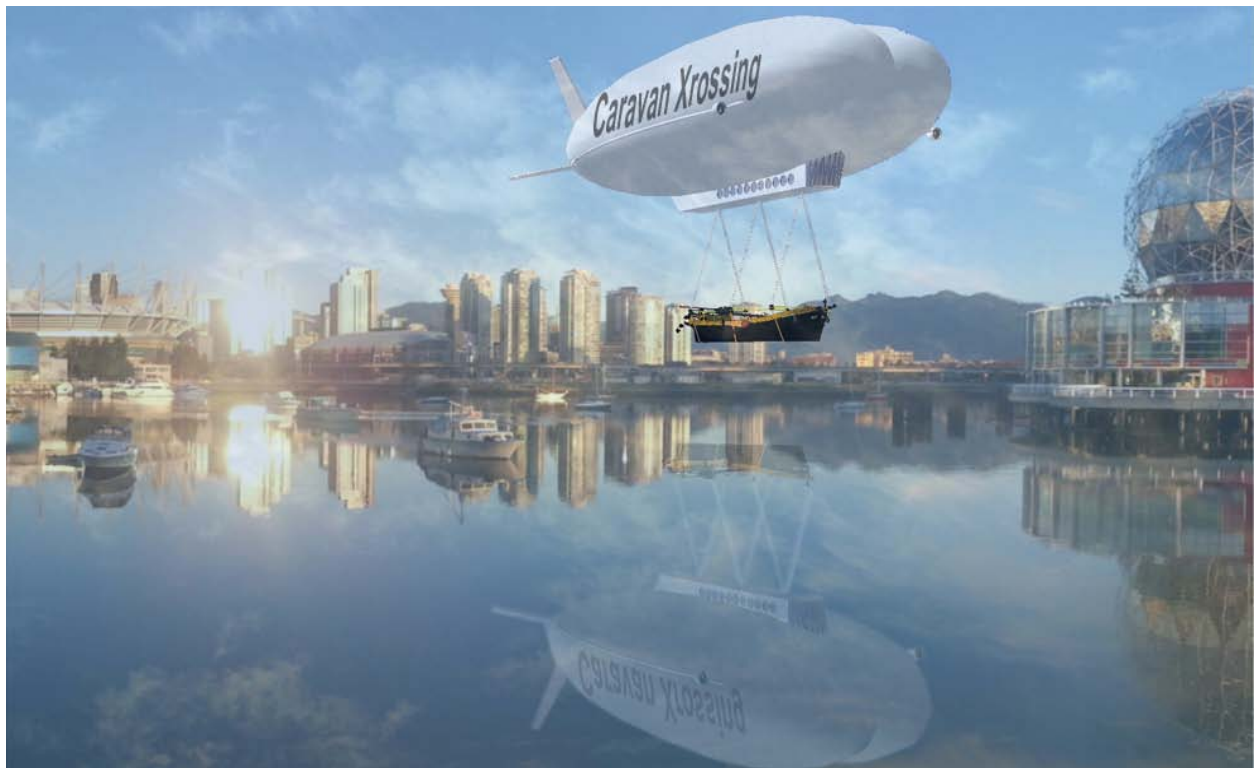
Caravan Air Ship landing in False Creek, Vancouver in August 2019

September 14 to 30, 2017: Nomadic Tempest opens in Vancouver in False Creek, in the heart of downtown Vancouver in one of the most vital venues in the City.